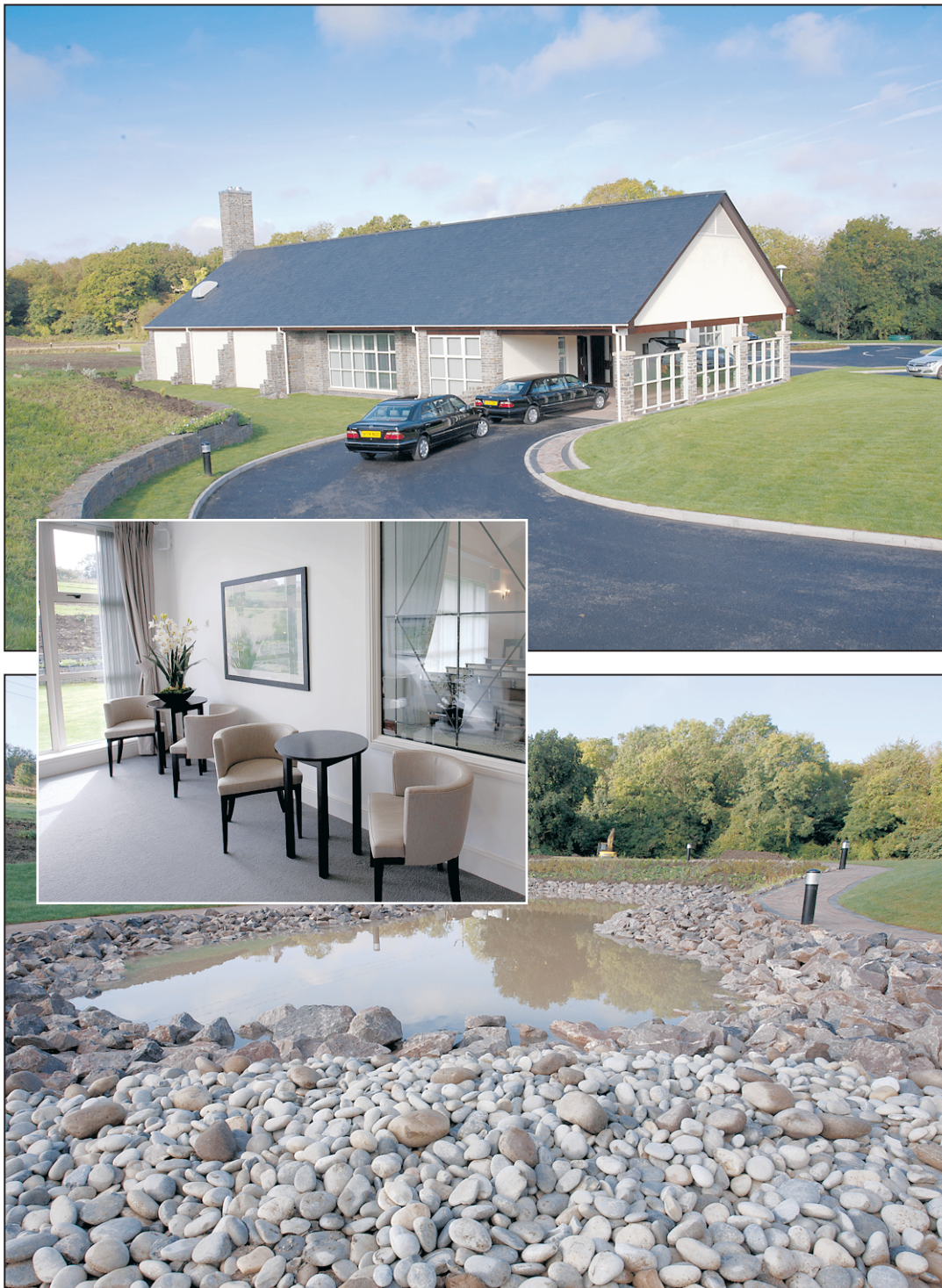
NEW SERVICE: Vale families now have additional choice for funeral arrangements.